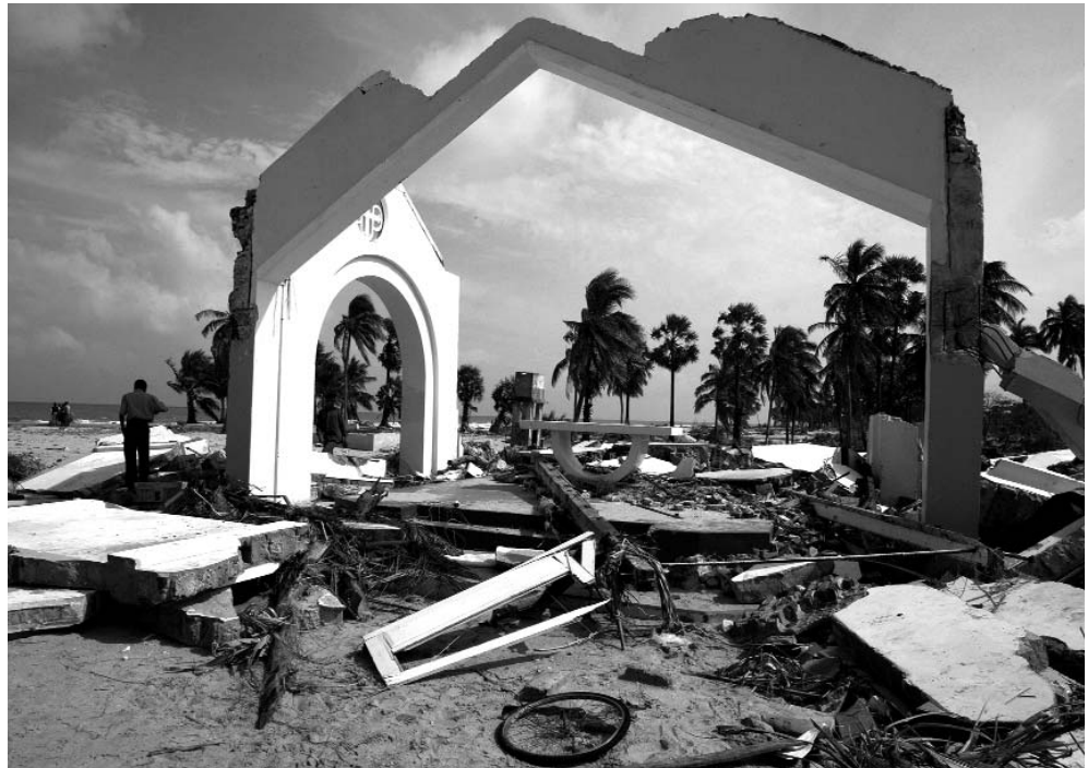
Sri Lanka’s eastern coast was devastated by last December’s tsunami. The disaster led to an unprecedented outpouring of charity all over the world.

Based on our study, the major weaknesses of the ratings agencies are threefold: They rely too heavily on simple analysis and ratios derived from poor-quality financial data; they overemphasize financial efficiency while ignoring the question of pro-